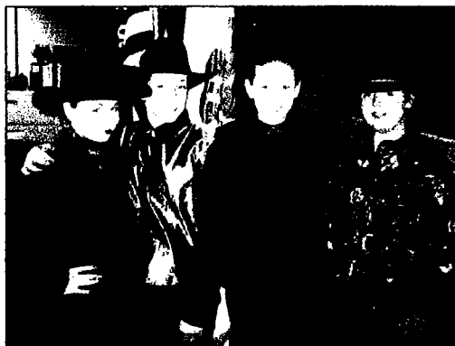
Participants from the Horse Tack Swap and Fashion Show.