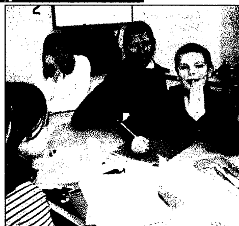
Record Keeping Workshop at the Lil' Bit of Chaos Club Meeting.