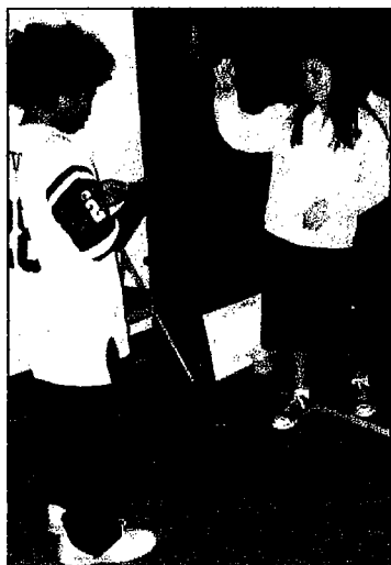
Natural Resource Education Class.

Teen PAC, the Lane County 4-H Older Youth Program, has begun writing a newsletter column in our 4-H newsletter, the CloverPatch .