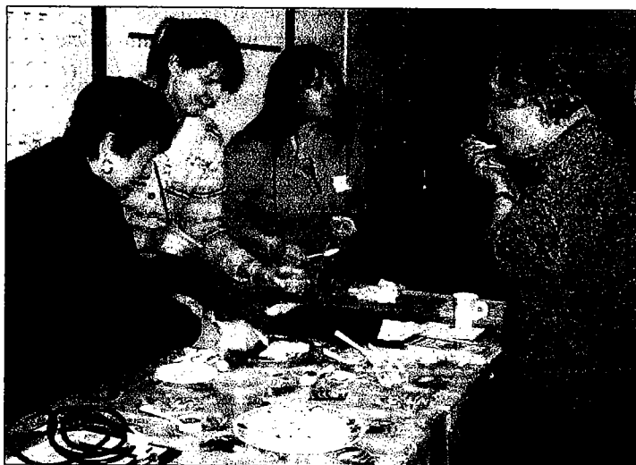
New, and veteran Food Pantry Volunteers testing new recipes developed for utilizing unusual foods.