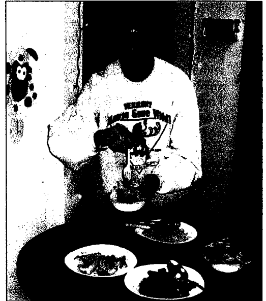
Participant at Laurel Hill Elementary School.

Success Recognized: The next weekly class session, following the hand washing activity, one young girl reported not washing her hands "for the rest of the school day so that she could go home and show her parents all the germs that were on her hands just from being at school." Her parents insisted she immediately wash her hands, but also had everyone in the family join her and they washed their hands together.